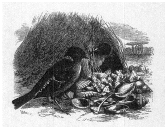
Figure 1: Bower building and behavioural male–male competition in the bowerbird ( Chlamydera maculata ). (From Darwin, 1871.)

As an example, for satin bower birds ( Ptilonorhynchus violaceus ), the quality of the bower built by the male provides a good indicator of overall male quality and is the primary determinant of female choice of mating partners (Borgia, 1985); an example of a bower is shown in Figure 1 . Skill at